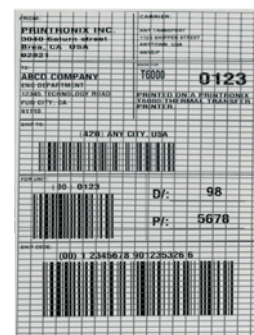
Full Overstrike Example

The upgraded T6000e with ODV-2D allows users to print and encode RFID labels and inspect and grade the quality of printed barcodes in a single pass. Now, one printer can now do the work of multiple devices to create a new level of productivity and cost savings. No longer are two separate machines needed to perform two completely different functions. This is a unique function not available on any other printer currently on the market.